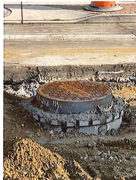
Figure 5: View of the manhole reset