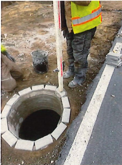
Figure 4: View of the laser level being used to set the new manhole casting