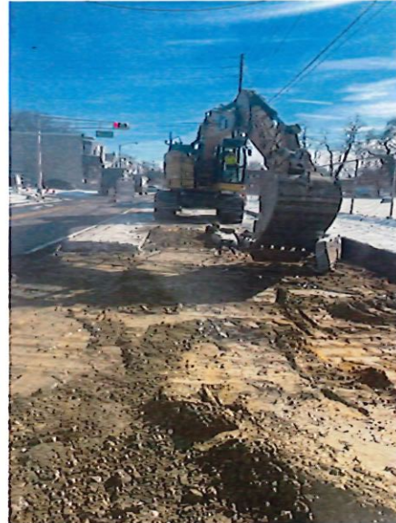
Figure 3: View of roadway pavement being removed