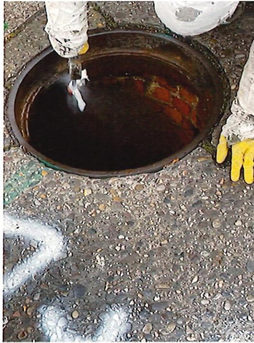
Figure 1: View of manhole being lined