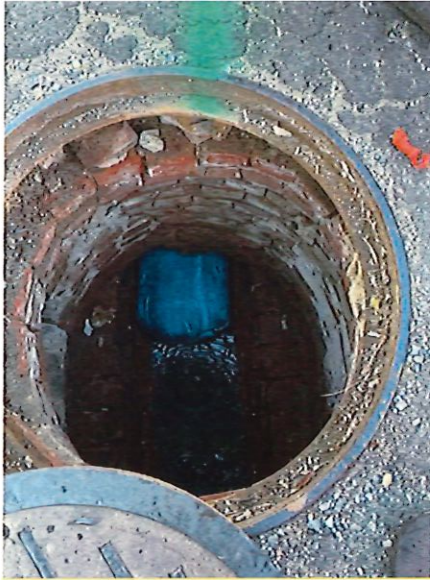
Figure 2: View of the inverted liner before curing