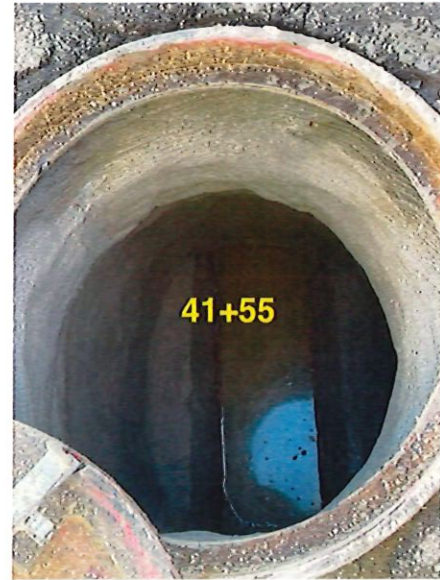
Figure 5: View of the manhole after lining