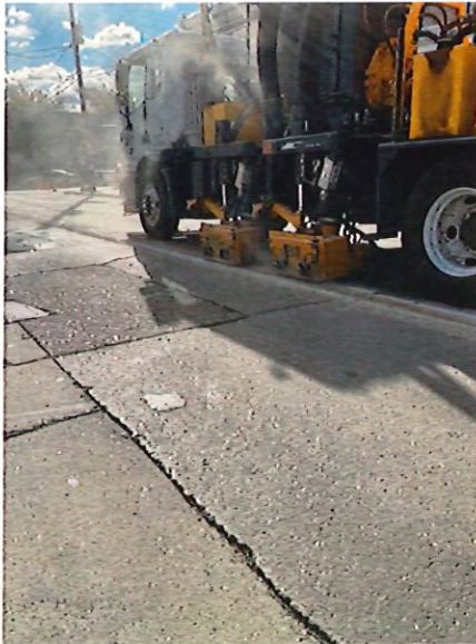
Figure 4: View of yellow lines being temporarily removed