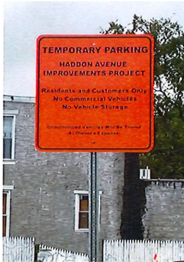
Figure 1: View of temporary parking sign installed at Walnut Ave