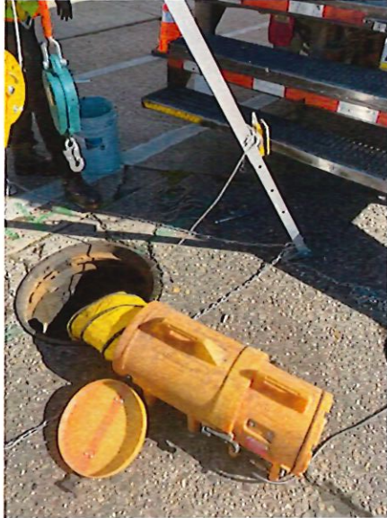
Figure 2: View of manhole being vented