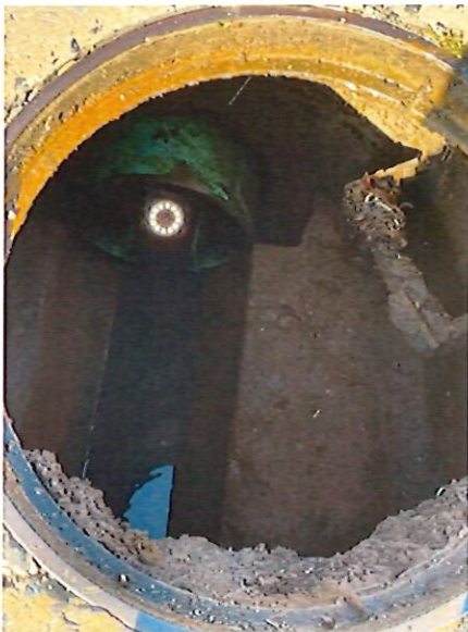
Figure 4: View of camera completing 15' pipe segment inspection