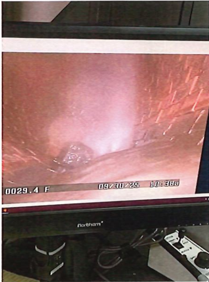
Figure 2: View of debris being moved upstream