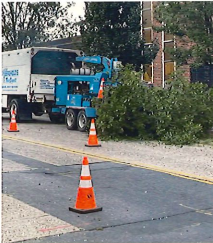
Figure 4: View of tree being chipped