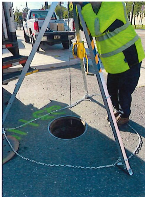
Figure 1: View of lowering video camera into sewer