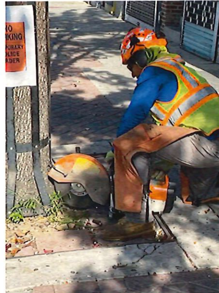
Figure 3: View of tree grate being removed