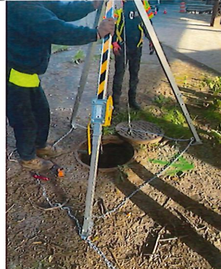
Figure 5: View of rescue equipment being used