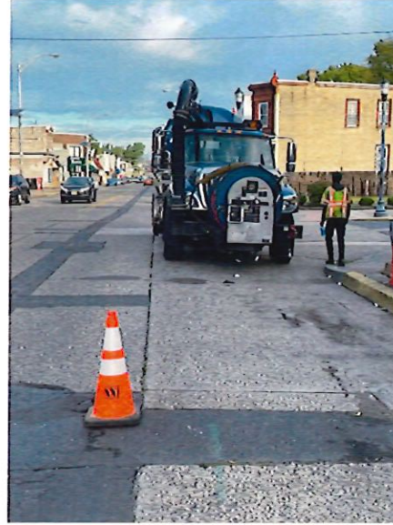
Figure 3: View of a vacuum truck being set up for cleaning pipelines