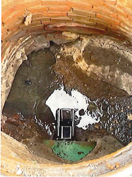
Figure 2: View of video equipment entering PVC pipe run