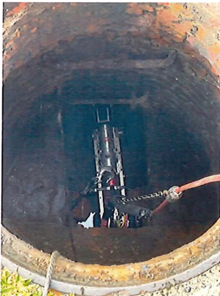
Figure 4: View of video equipment prepared for inspection of the pipe