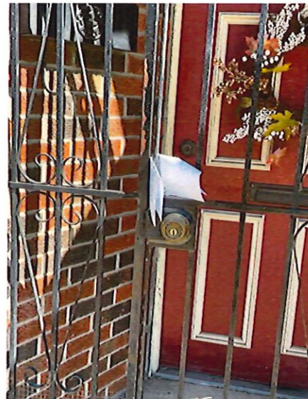
Figure 5: View of flyer placed in residence mailbox near Liberty Street